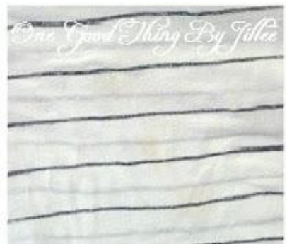
after RUBBING THE FABRIC TOGETHER!