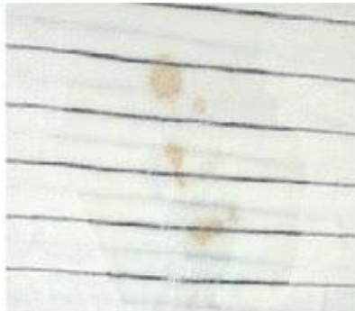
after SPRAYING WITH faux "SHOUT"